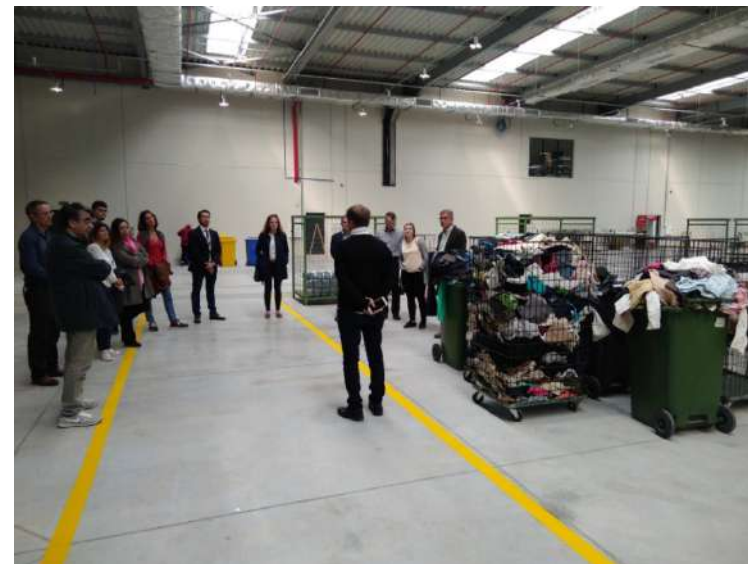
Study visit, October 2018, Sofia