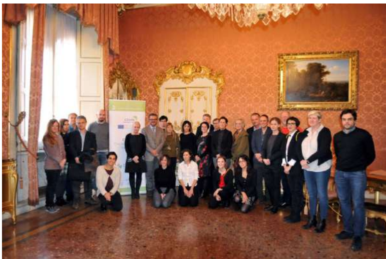
Project meeting, November 2016, Bologna