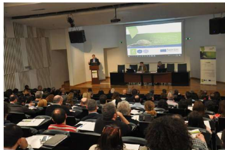
International Conference, March 2018, Thessaloniki