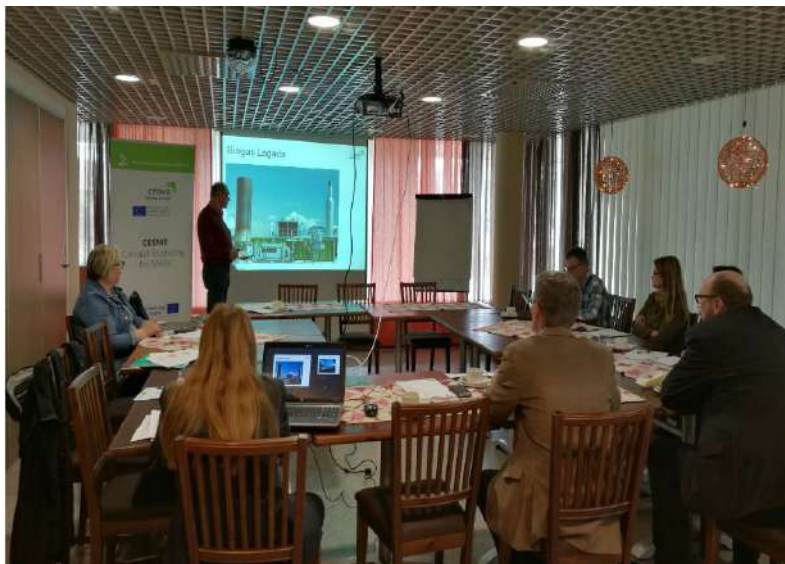
LSG meeting, June 2017, Seinäjoki